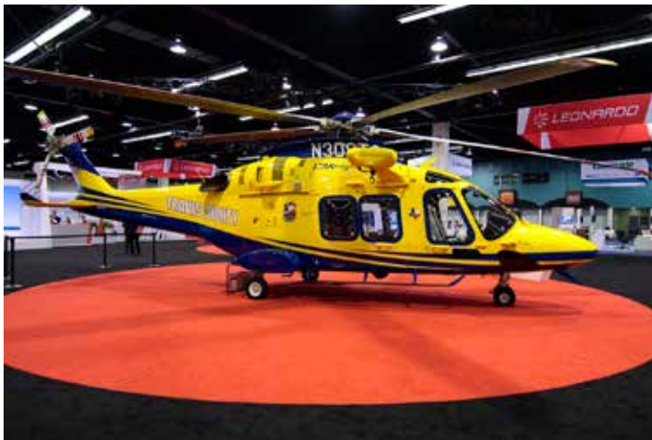
Clockwise from above: MD Armed 530F showing off its stuff; Army Aviation Heritage Foundation Bell AH-1 Cobra Attack Helicopter; Enstrom 480B; Airbus H130; and EMS AW-169 operated by STAR Flight Travis County, Texas.