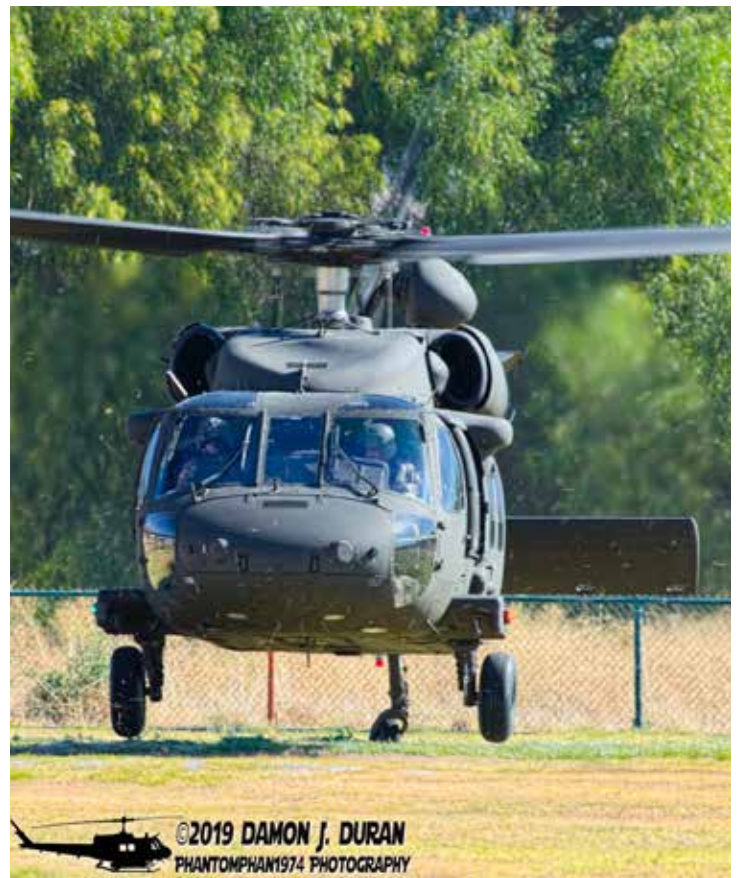
Clockwise from above: CAL FIRE UH-1H Super Huey and a Mercy Air EC-135; CAL FIRE Huey and Mercy Air on short approach; CA ANG landing in the LZ; and Los Angeles City FD helicopter for AW-139, Copter 4 downwind to the LZ.