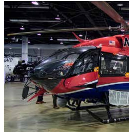
San Diego Gas & Electric H145 utility helicopter

firehawks which have grown in numbers in recent months here in California. It was great to see in person CalFire's new aircraft after seeing renderings of it over the past year or so. It was in the United Rotorcraft booth who outfits most of the Firehawks out there. LA County Fire Dept brought their new Firehawk as well and was displayed at the Sikorsky booth. Aerometals hosted San Diego Fire Dept's Firehawk as well. It was great to see it fully outfitted by United Rotorcraft. I was able to see it shortly after it flew home to San Diego and with the popularity of the Firehawk there was some time between San Diego getting the S-70i and when they were scheduled to