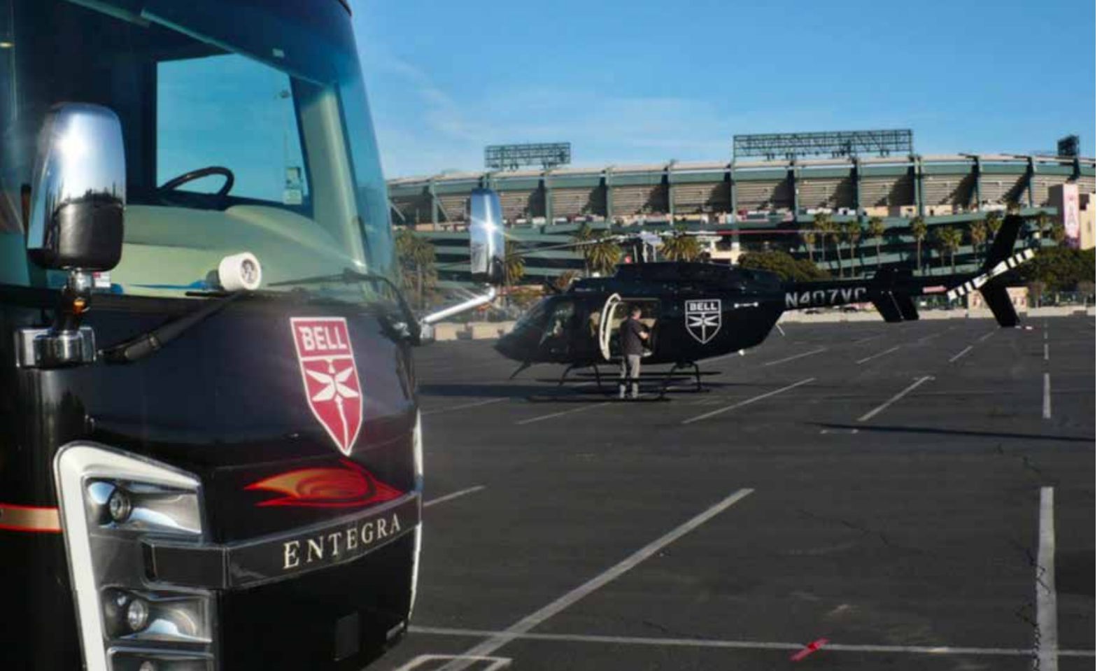
First Light on the LZ brought in arrivals with the three Bell Helicopter in first along with their awesome mobile marketing vehicle.

Our teamwork on the Heli-Expo Manufacturers' Demonstration Ramp once again proved to be a uniquely aligned project to both promote & support our PHPA Organizational Mission while providing a unique opportunity to engage with our highly active membership.