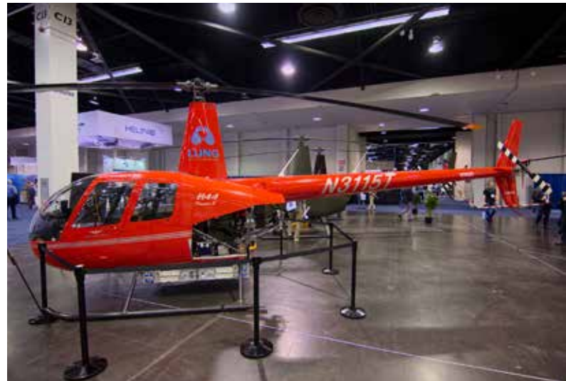
Tier 1 Robinson R44 Electric helicopter demonstrator

PHPA, an HAI affiliate, provided ground operations management for the HeliExpo Demonstration Ramp at Angels Stadium. Some of the helicopter manufacturers had helicopters available for test flights. Those included Airbus