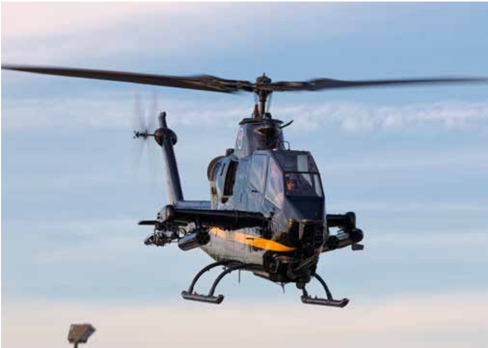
Army Aviation Heritage Foundation Cobra