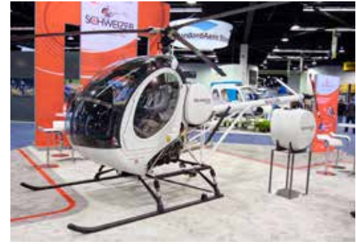
Schweizer S300 CBI