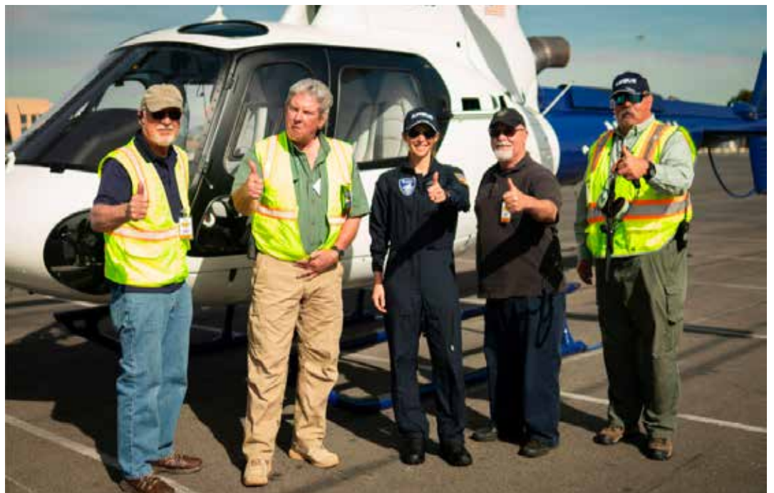
Prior to departure on Thursday we were pleased to get a "thumbs up" for our ramp operations team from the Airbus Helicopters pilot (center).