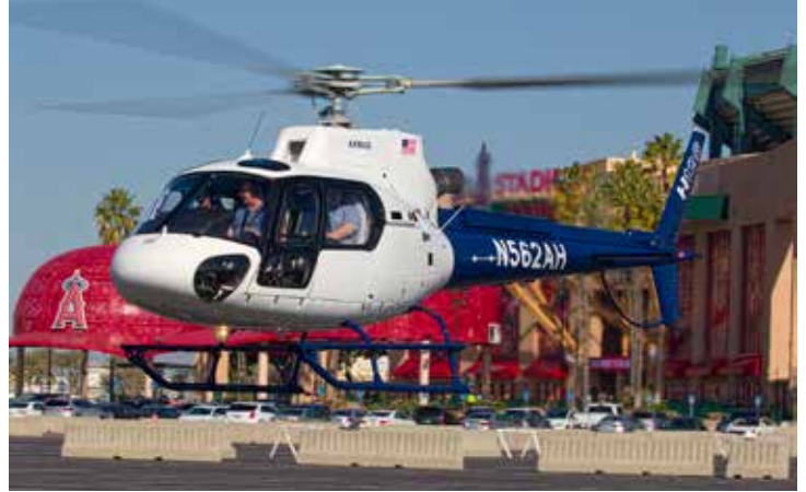
Clockwise from above: Bell 505, Jet Ranger X downwind to the MDR; Airbus H130; Airbus H135 and H125 hovering for departure with customers; Bell 429 and Honeywell Leonardo AW189 on final to the MDR; and finally, Bell 407GX i on a flight demonstration.