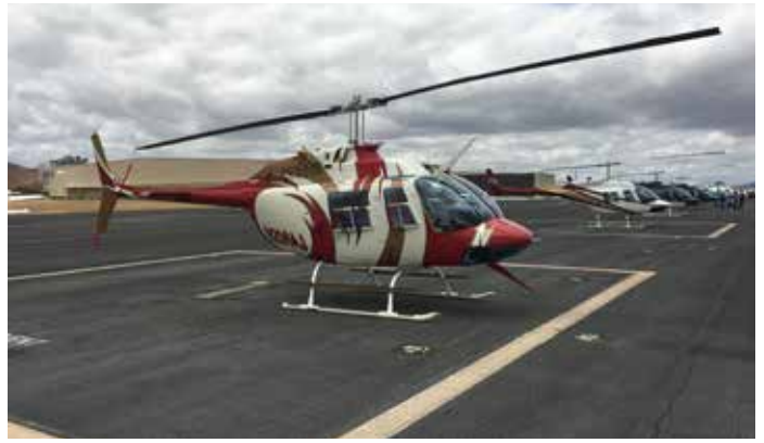
Bell 206 Jet Ranger

After lunch, we watch as one-by-one the helicopters departed. Some gave us a nice zoomie fly-by before they departed. The Gazelle is always one to show his stuff, and he did not disappoint. The fly-in was another success,