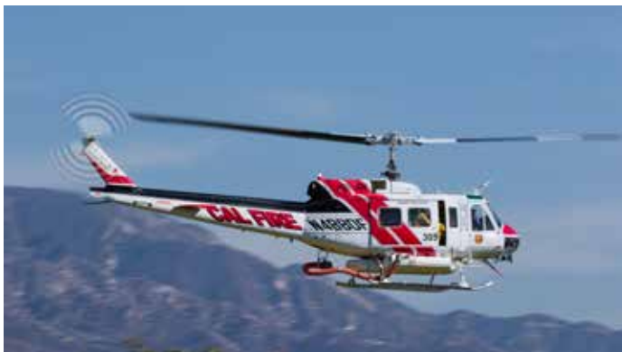
Cal Fire Bell 205 Super Huey

Damon's work can be found on Instagram, Facebook and Flickr under PhantomPhan1974 Photography.