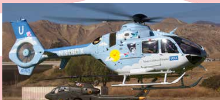
Reach Air Med 22 EC-135P2+