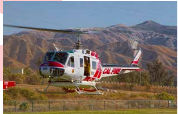
CalFire Bell 205A Super Huey