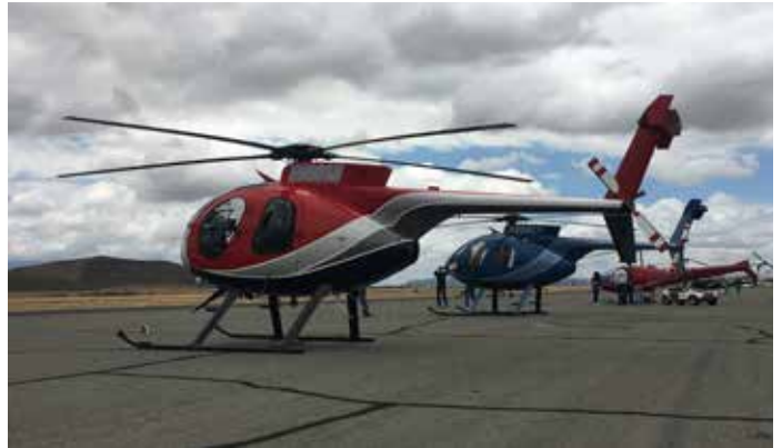
Hughes 500D & MD -500E