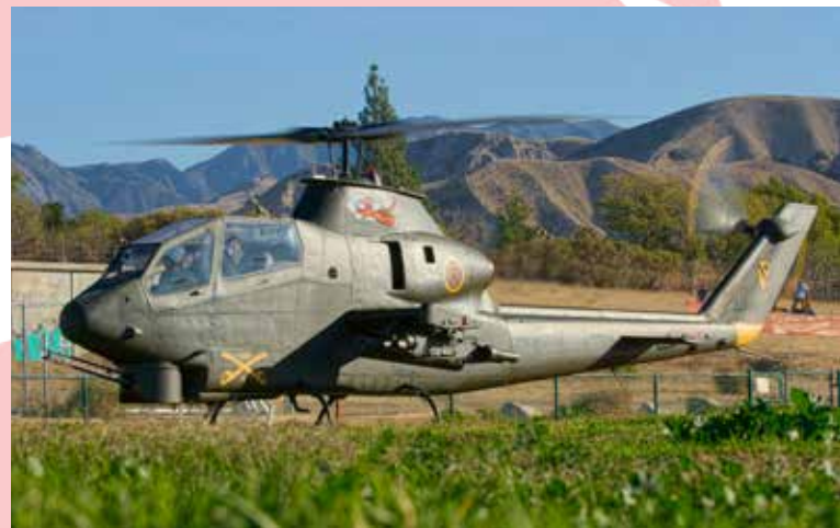
Bell AH-1S Cobra