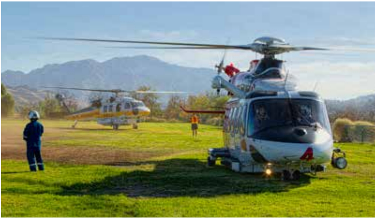
LA Co Fire SK-70 Firehawk & LAFD AW-139