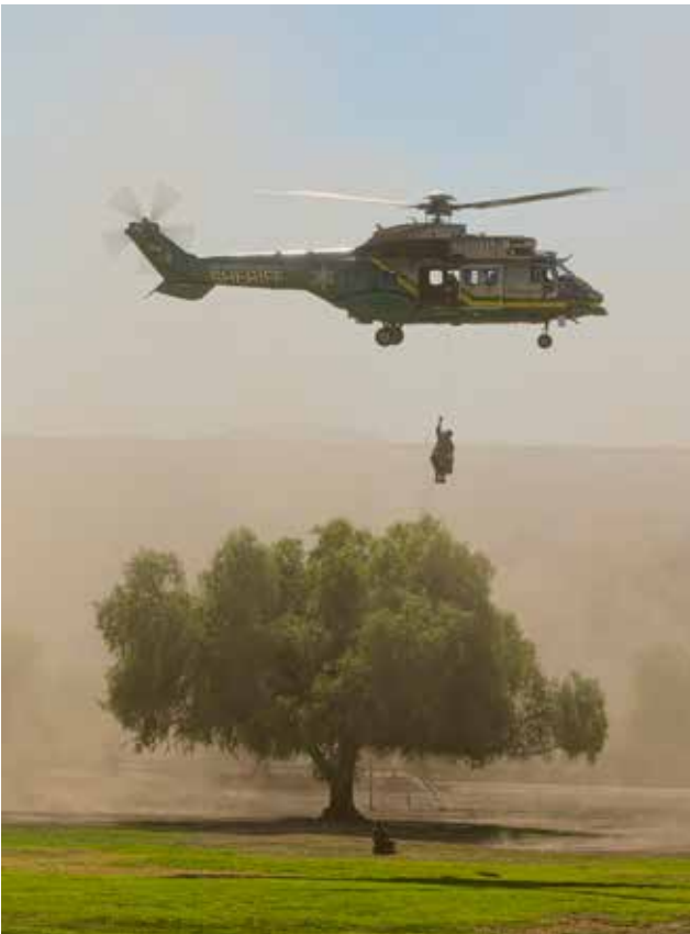
LASD Air 5 SAR Demo