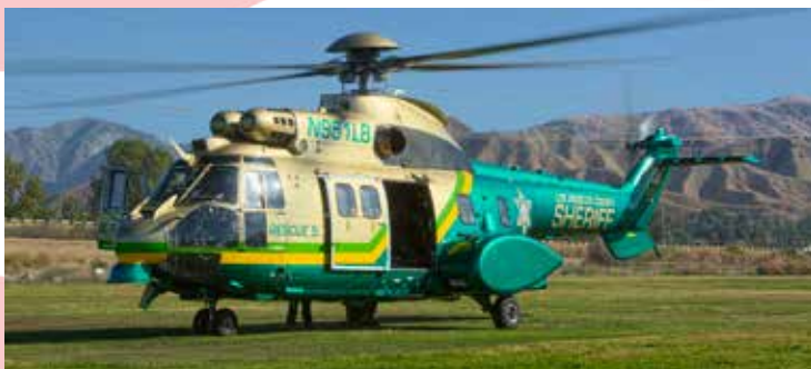
LASD Air5 EC-225 Super Puma