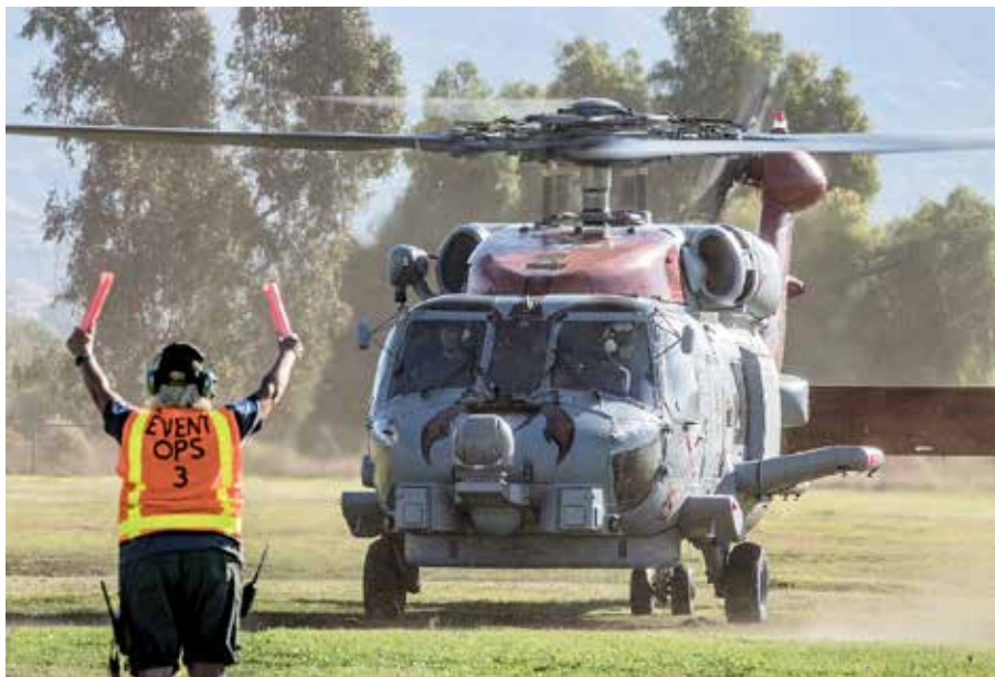
U.S. Navy VX-49 "Scorpions" MH-60 Seahawk