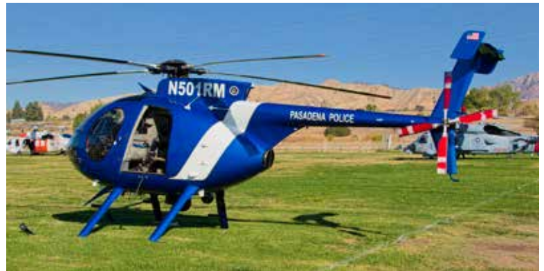
Pasadena PD MD-500E