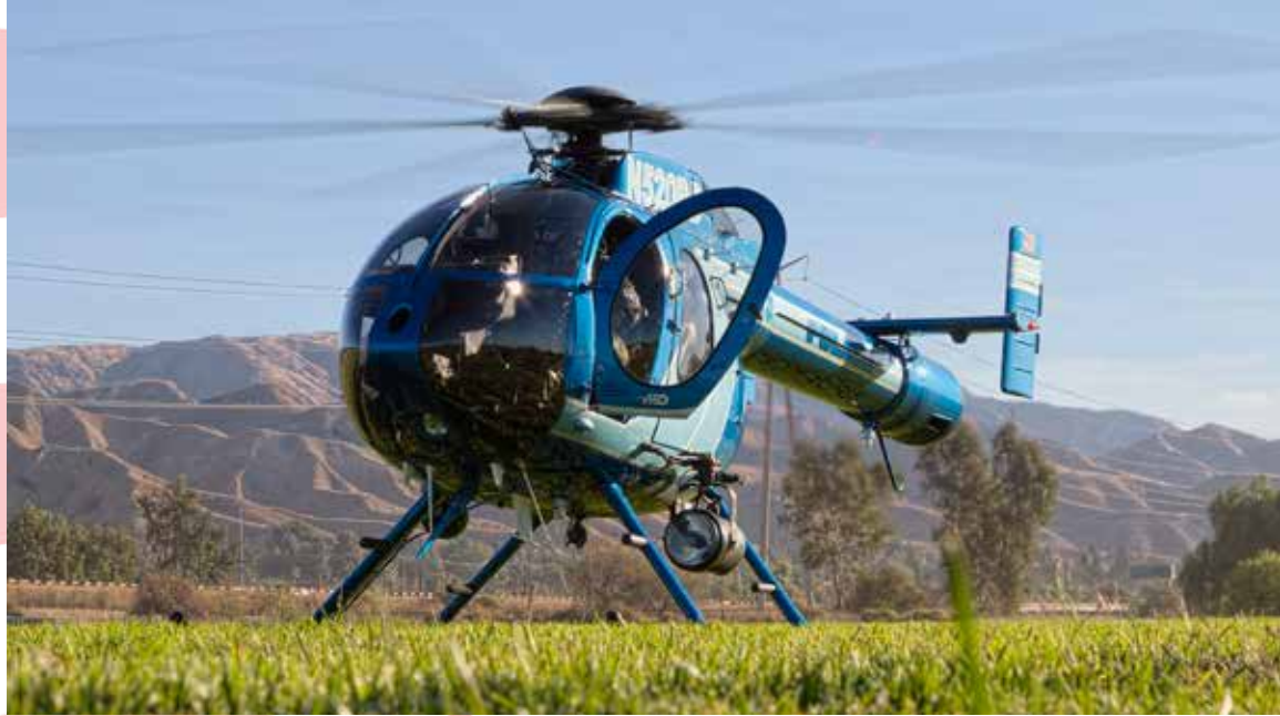
Glendale/Burbank PD MD-520N