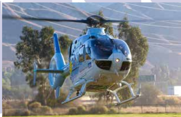
Reach Air Med 22 EC-135P2+