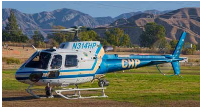
Calif Highway Patrol AS-350B3 Astar