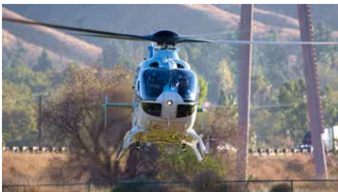
Reach Med EC-135P2+