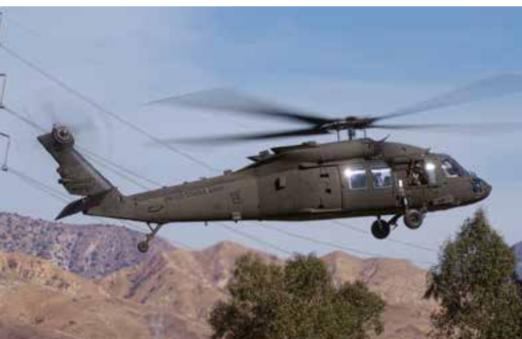
Calif. Air National Guard UH-60M Blackhawk