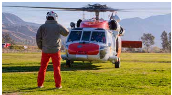
USN VX-31 "Dust Devils" MH-60 Seahawk