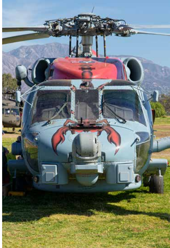
USN VX-49 "Scorpions" SH-60 Seahawk