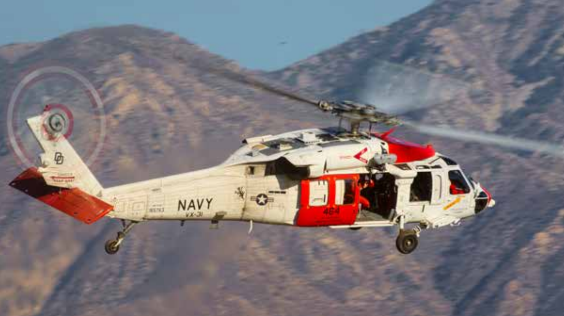
USN VX-31 MH-60 "Dust Devils" SAR Seahawk