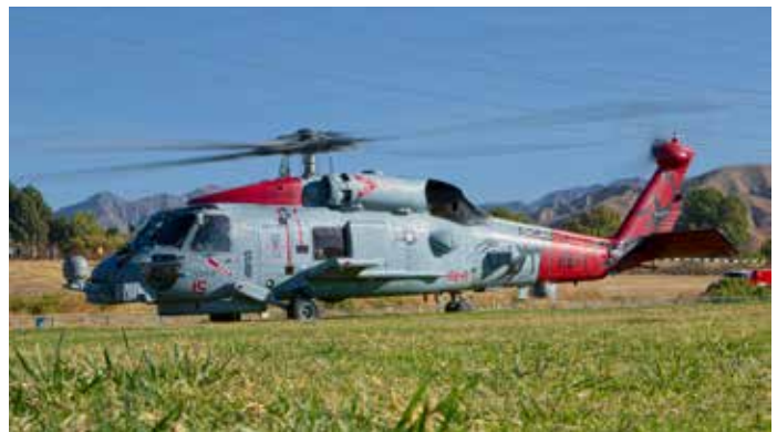
USN VX-49 "Scorpions" SH-60 Seahawk