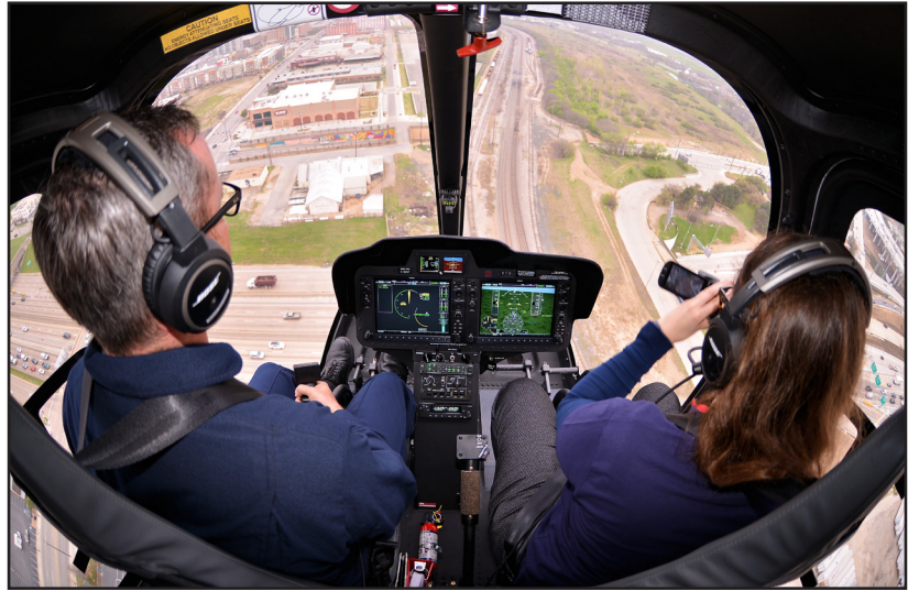
Inside view of the new Bell 505 in flight