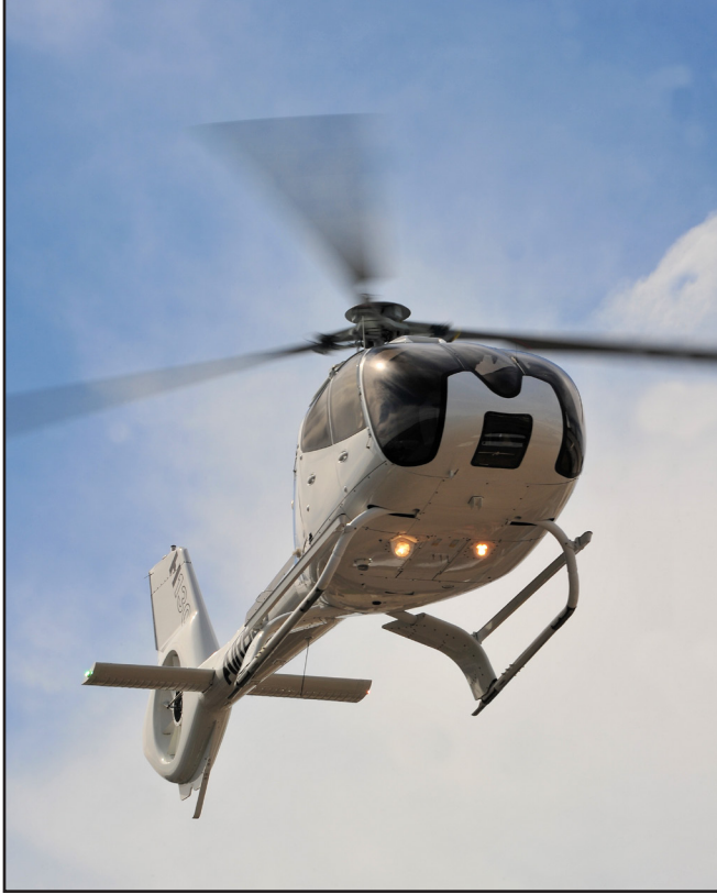
Airbus H130 on approach to the convention center