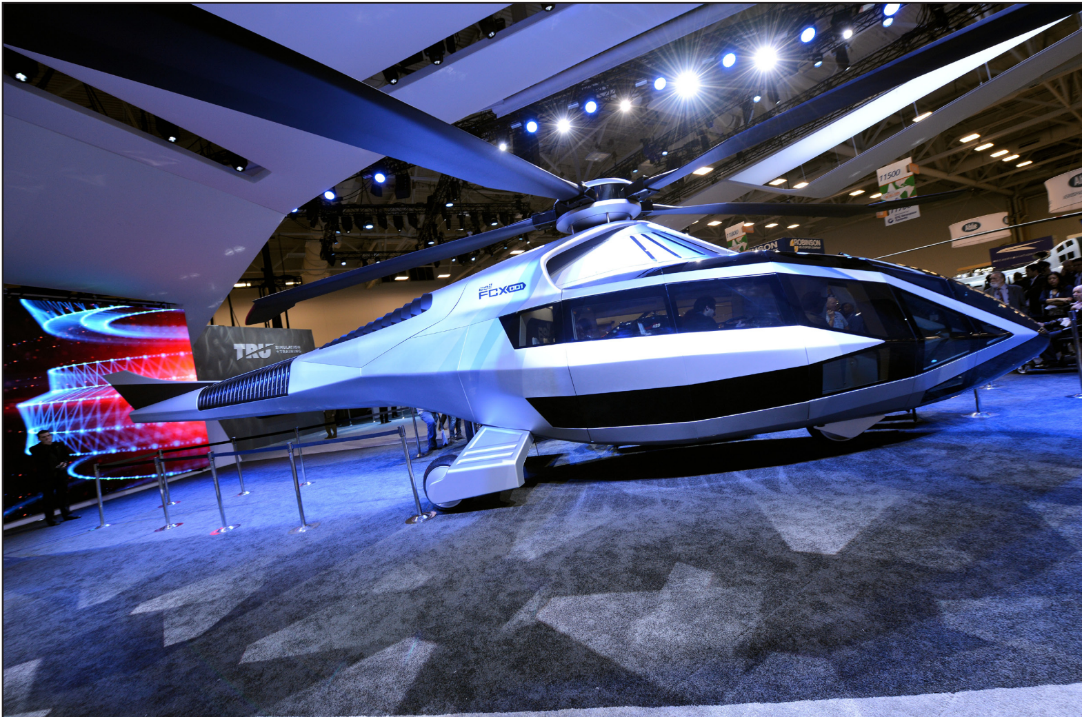
Futuristic Bell mock-up demonstrator