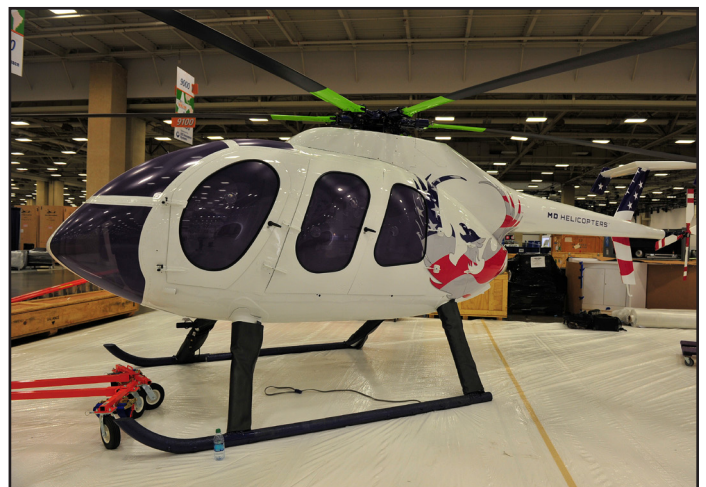
New prototype MD-600 with a tail rotor

My second hat was as candidate for the Government