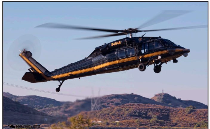
The U.S. Customs & Border Protection UH-60 arrives from their Air & Marine Interdiction base at North Island, San Diego, CA