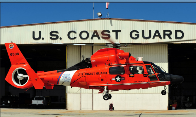
The last HH-65 Dauphin departure out of Coast Guard Air Station Los Angeles