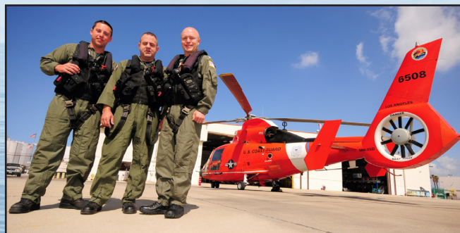
The crew of the last HH-65 Dauphin departure out of Coast Guard Air Station Los Angeles