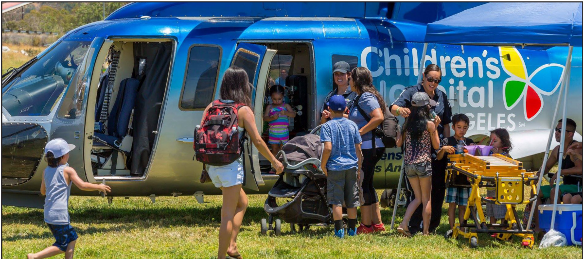
Right: S-76C EMS helicopter from Children's Hospital Los Angeles, operated by Helinet Aviation