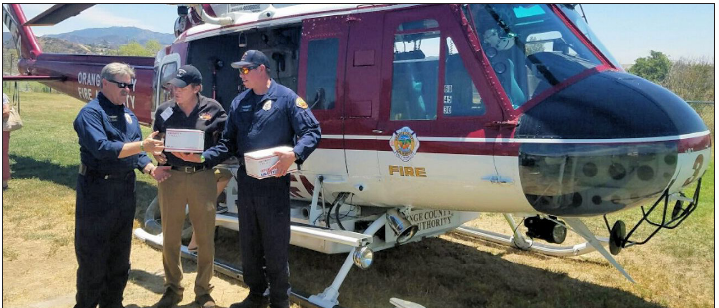
Orange County Fire Authority UH-1