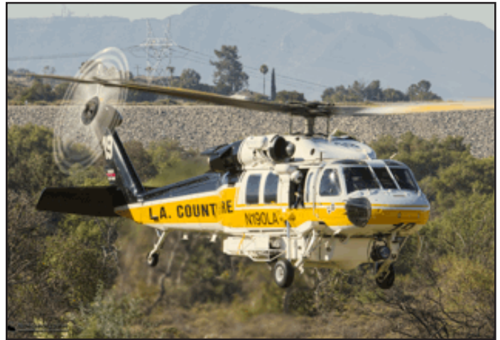
LA County Fire Hawk arrives at the Air Show

This admission-free event is a great opportunity for the PHPA to distribute information to both the helicopter owners' community and share information with the public about the unique role which rotary-wing aviation plays everyday to the Southern California community.